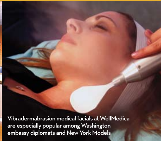
Vibradermabrasion medical facials at WellMedica are especially popular among Washington embassy diplomats and New York Models