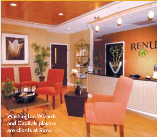
Washington Wizards and Capitals players are clients at Renu